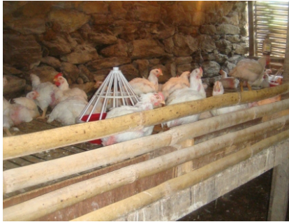
Raised floor system