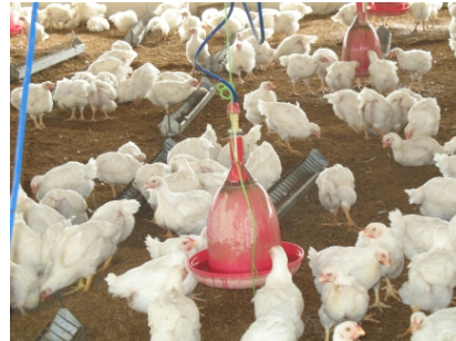
Deep litter system

For building a low cost housing system, locally available material like bamboo, mud, thatch roof/chitra etc can be used .